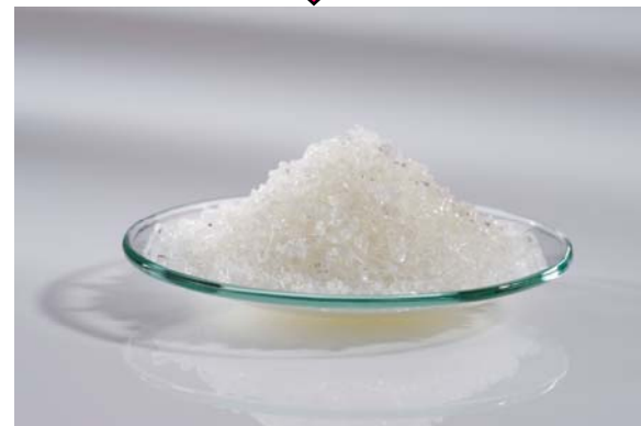
Soluplus (milled extrudate)